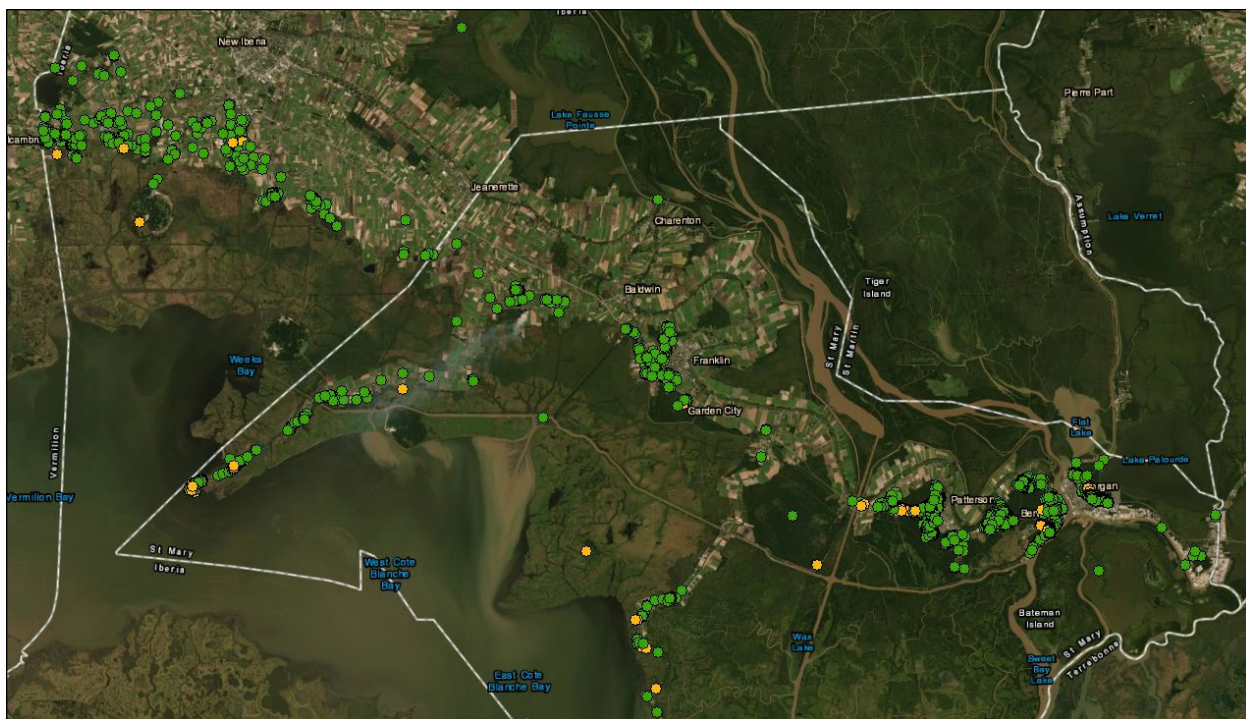
Figure A7:3-1. Nonstructural Plan – 0.04 AEP (25-Year) Floodplain Aggregation (Dots indicate structures where 25-year flood damages occur.)